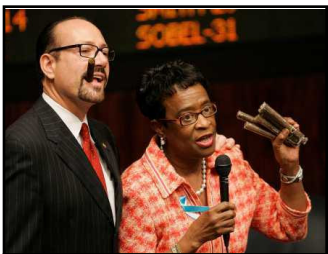
Sen. Victor Crist (left), R-Tampa, and Sen. Arthenia Joyner (right), D-Tampa, bear home-district cigars as they debate the tobacco tax in the Florida Senate. Certain Cigars are exempt from the increases tobacco tax.

Legislative Republicans, who have resisted higher taxes since coming to power in 1996, also embraced the tax amid a $6 billion budget deficit. In fact, the Florida State Senate passed their version of the tax increase by 39-0 vote, despite intense lobbying from Big Tobacco, a stinging letter of disapproval from Republican anti-tax crusader Grover Norquist, and obvious opposition from House Republicans.