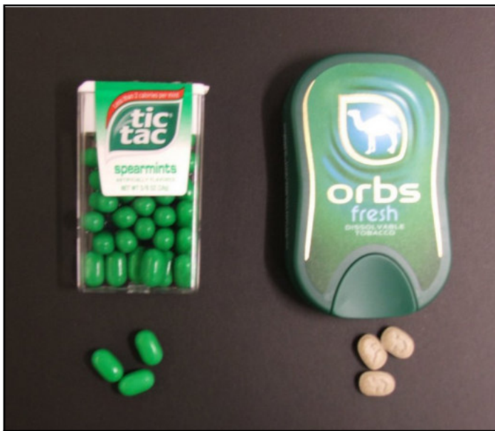
Camel Orbs are the size and shape of Tic-Tacs. Even the leaf-shaped logo on the two packages are similar. Is this just a coincidence? Or, is R.J. Reynolds trying to blur the lines between candy and tobacco?