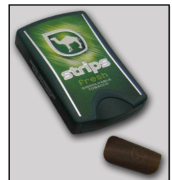
Next up? Camel Strips! Why use Listerine when you can use nicotine!

The packaging of Camel Orbs also caught the attention of Shelly Kiser of the American