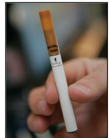
The electronic cigarette is a device that combines a computer chip, a rechargeable battery and an atomizer that emits a nicotine mist.