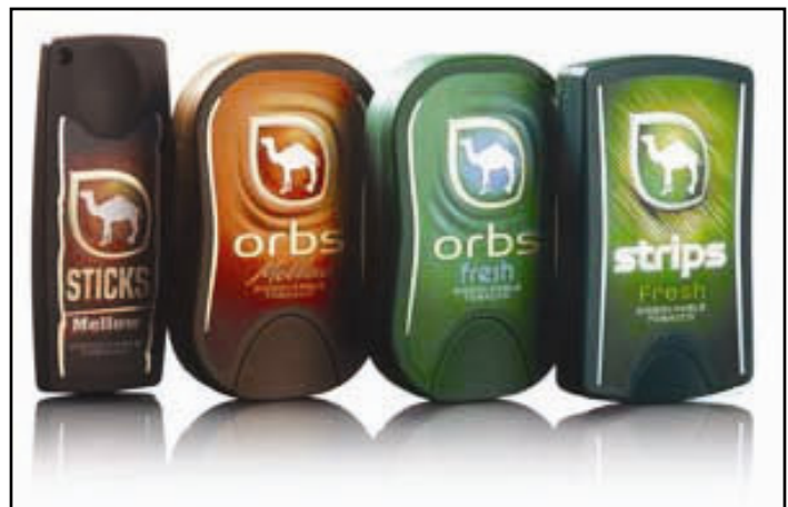
R.J. Reynolds claims that the packages for its new edible products are designed for adults, and are "clearly marketed as tobacco products and they carry the same warnings as tobacco products." Do you agree?

only for adults over the age of 18, further adding that the new products "meet the societal expectation of no second-hand smoke, no spitting, and in the case of dissolvables, no litter. The bottom line is these are tobacco products. They are clearly marketed as tobacco products, they are marketed as tobacco products and they carry the same warnings as tobacco products."